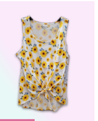
ALL OVER PRINT TANK TOP