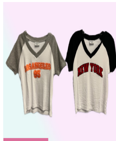
V-NECK COLORBLOCK TEE WITH EMBELLISHMENT