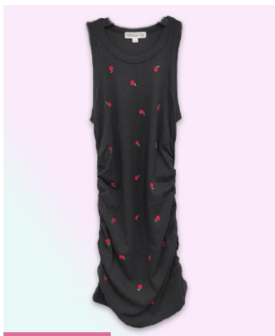
SLEEVELESSDRESSWITHSIDE RUCHING 58/38/4 Cotton / Polyester / Spandex