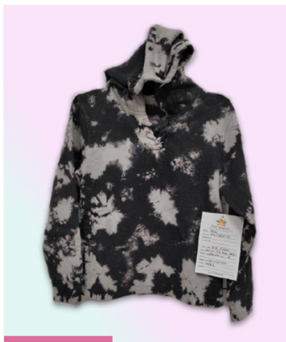
LONG SLEEVE HOODED FLEECE WITH MINERAL WASH CVC Fleece