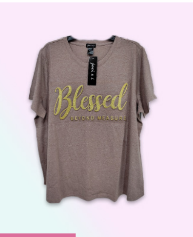
CREW NECK TEE WITH EMBELLISHMENT