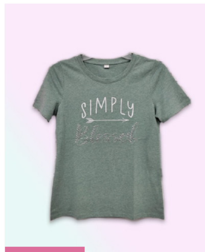
CREW NECK TEE WITH EMBELLISHMENT