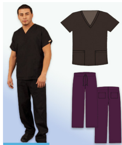
OVERLAPPED V NECK TOP STYLE#7001