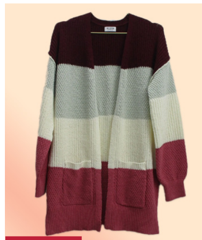
LONG SLEEVE CARDIGAN