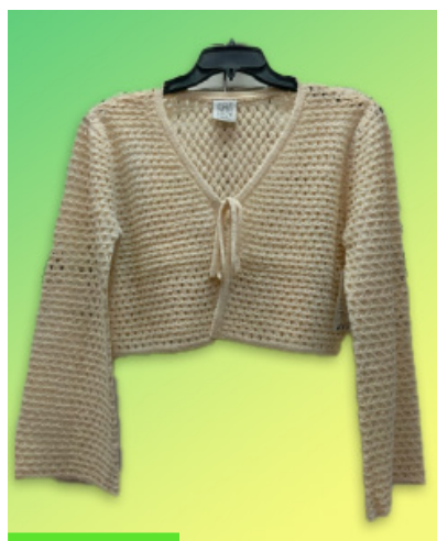
LONG SLEEVE CARDIGAN