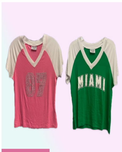
V-NECK COLORBLOCK TEE WITH EMBELLISHMENT