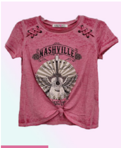
CREWNECKTEEWITHBURNOUT WASH 60% Cotton 40% Polyester