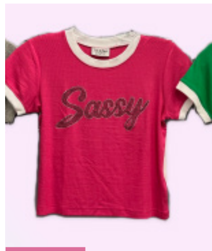
CREW NECK TEE WITH EMBELLISHMENT