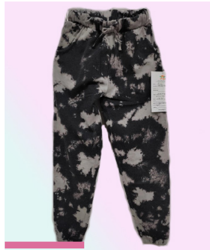
LONG SLEEVE HOODED FLEECE WITH MINERAL WASH CVC Fleece