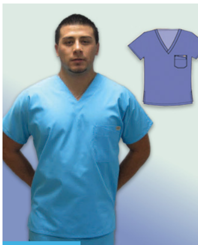
OVERLAPPED V NECK TOP STYLE#7000 UNISEX