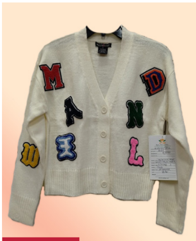
LONG SLEEVE CARDIGAN

59% Polyester 34% Acrylic 5% Nylon 2% Spandex (Mossy Yarn)