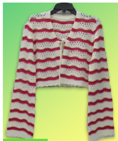
LONG SLEEVE CARDIGAN