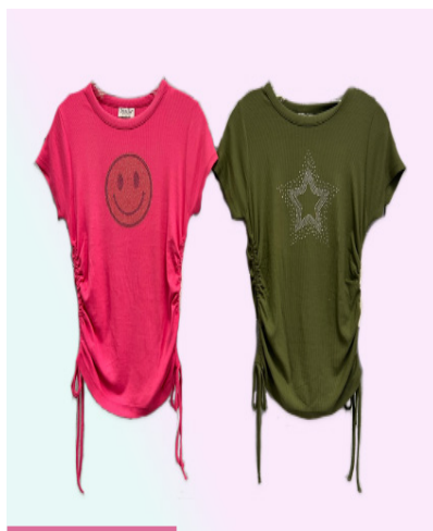
CREW NECK SIDE RUCHING TEE WITH EMBELLISHMENT