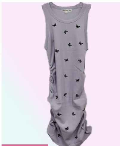
SLEEVELESSDRESSWITHSIDE RUCHING 58/38/4 Cotton / Polyester / Spandex