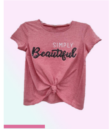
CREWNECKTEEWITHBURNOUT WASH 60% Cotton 40% Polyester