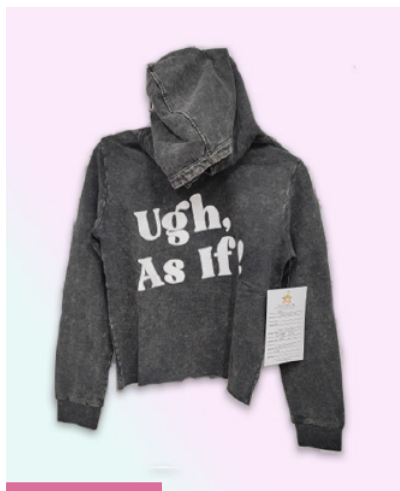
LONG SLEEVE HOODED FLEECE WITH MINERAL WASH CVC Fleece