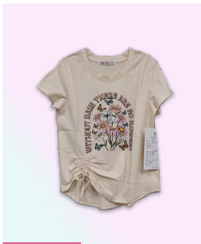
CREWNECKTEEWITHBURNOUT WASH 60% Cotton 40% Polyester