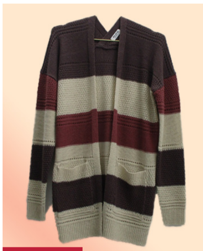
LONG SLEEVE CARDIGAN