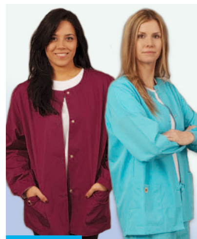
LONG SLEEVE STYLE#7007 HELEN