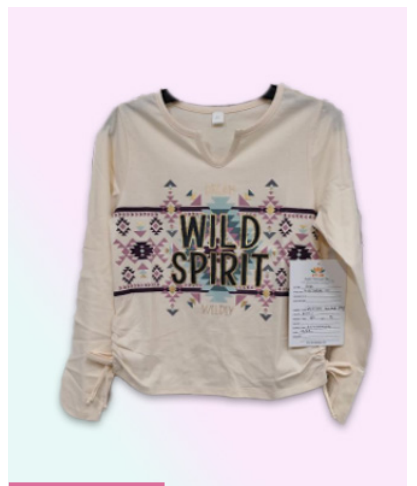
CREWNECKTEEWITHBURNOUT WASH 60% Cotton 40% Polyester