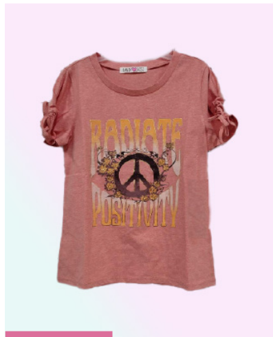
CREWNECKTEEWITHBURNOUT WASH 60% Cotton 40% Polyester