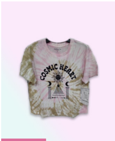
CREWNECKTEE-TIEDYEWASH Cotton / Polyester Jersey