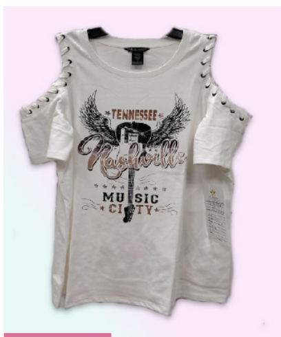
COLD SHOULDER TEE WITH GROMMETS 60% Cotton 40% Polyester