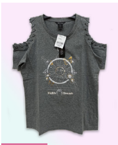
COLD SHOULDER TEE WITH GROMMETS 60% Cotton 40% Polyester