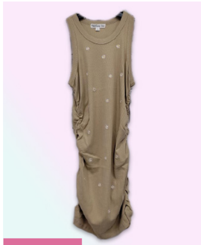
SLEEVELESSDRESSWITHSIDE RUCHING 58/38/4 Cotton / Polyester / Spandex