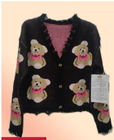
LONG SLEEVE CARDIGAN