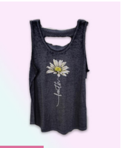
BURNOUT WASH TANK TOP