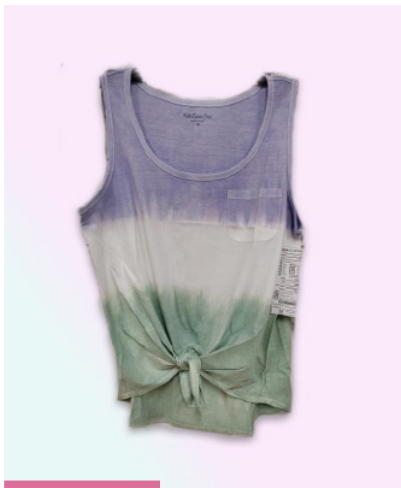
TIE DYE TANK TOP