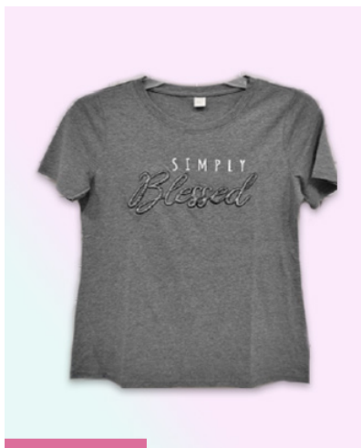
CREW NECK TEE WITH EMBELLISHMENT