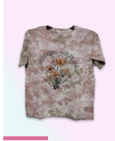
CREWNECKTEE-TIEDYEWASH Cotton / Polyester Jersey