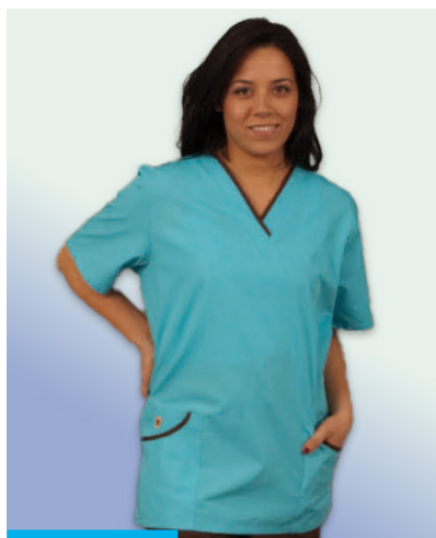
V-NECK CROSSOVER TOP STYLE#7005