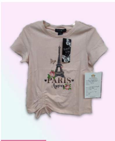
CREWNECKTEEWITHBURNOUT WASH 60% Cotton 40% Polyester