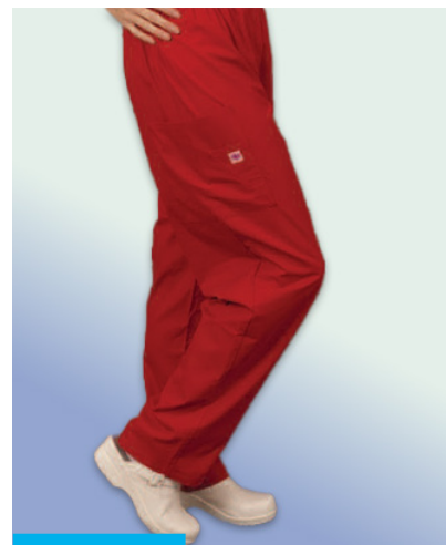
TWO POCKETS AT BOTTOM STYLE#1401 LILY