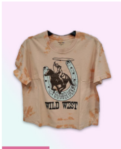
CREWNECKTEE-TIEDYEWASH Cotton / Polyester Jersey