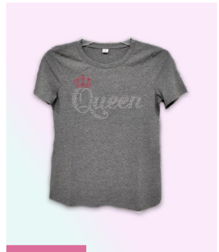
COLD SHOULDER TEE WITH GROMMETS 60% Cotton 40% Polyester