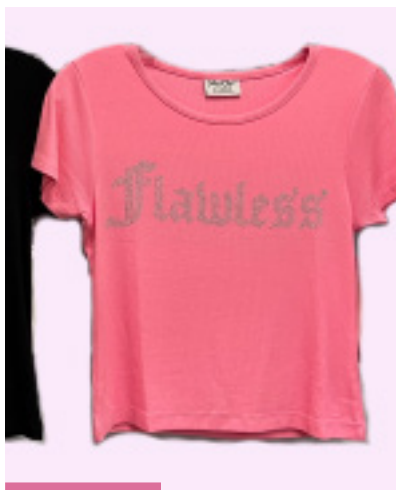
CREW NECK TEE WITH EMBELLISHMENT