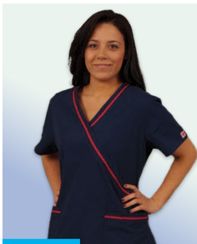
CROSSOVER V NECK TOP STYLE#1301 CLAIRE