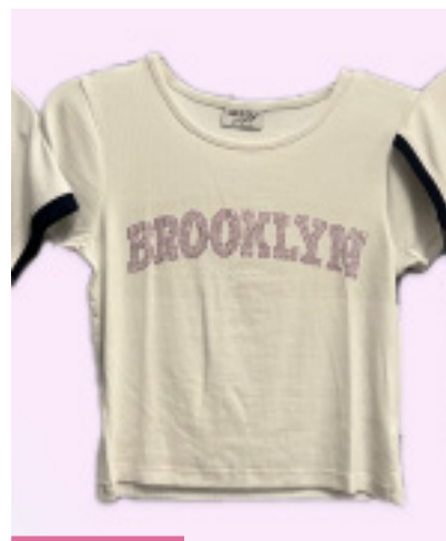
CREW NECK TEE WITH EMBELLISHMENT