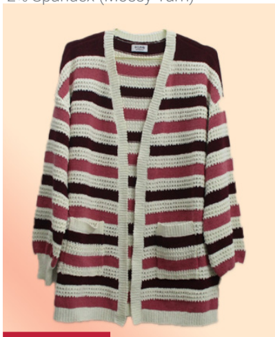
LONG SLEEVE CARDIGAN