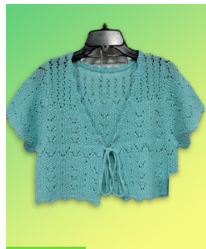
SHORT SLEEVE CARDIGAN